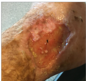
Figure 9. Some improvement when compression therapy commenced although once initial improvement remains static (June 2018)