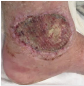
Figure 8. The wound following failed skin graft (January 2018)