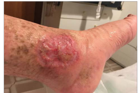
Figure 11. The wound following 21 days of treatment with NATROX (September 2018)