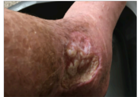
Figure 10. Continued non-healing upon commencing treatment with NATROX (August 2018)

Following 21 days of treatment with NATROX, significant improvement was seen, with the wound finally progressing towards healing [Figure 11]. This resulted in huge benefits to the patient's quality of life, meaning that she could resume everyday activities and go on holiday, and she was extremely pleased with the results.