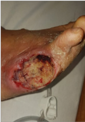
Figure 2. The wound following reperfusion and debridement (January 2018)

of wound aetiologies and clinical scenarios. The cases below were selected as examples to illustrate the breadth of potential uses and in differing goals of therapy.